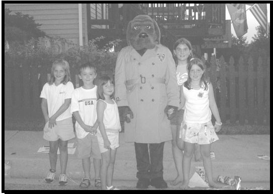
McGruff visits the neighborhood kids